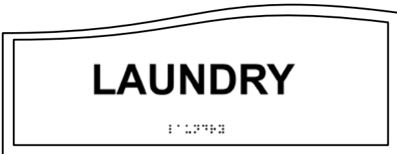
Standard Room Name 3x8, 3x10, 4x8 & 4x10 *number of characters depicts size