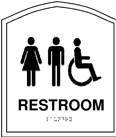
Standard Unisex Restroom Pictogram 6x8