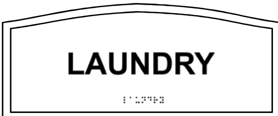
Standard Room Name 3x8, 3x10, 4x8 & 4x10 *number of characters depicts size