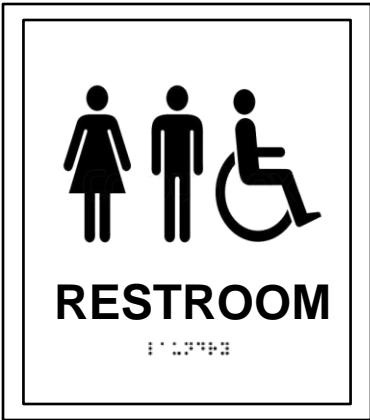
Standard Unisex Restroom Pictogram 6x8