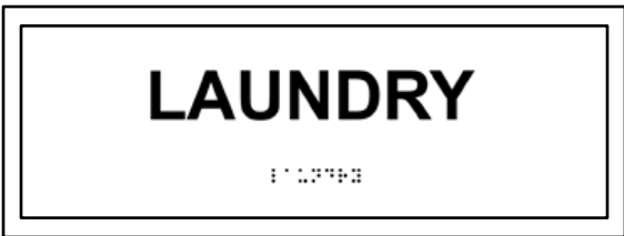
Standard Room Name 3x8, 3x10, 4x8 & 4x10 *number of characters depicts size